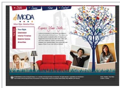
INTERIOR WEB PAGE

The new diMODA homes, as colorful in exterior paint as they are in interior personality, broke through sales projections during a down economy. The "diMODA" concept sold. And its website and branding, provided by Ad Ventures, sold the concept. Twenty-four homes sold in Spring 2009 alone...Phase II now building.